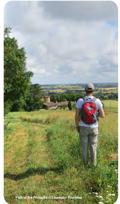
Path of the Pistoille